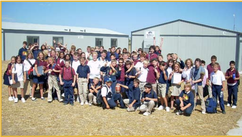
The entire CVSA Student Body