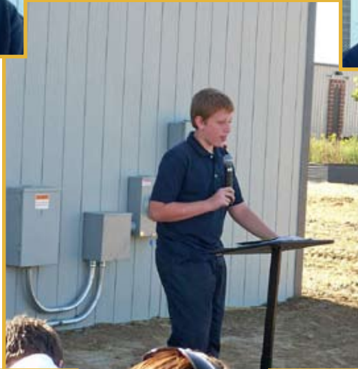
Making a campaign speech