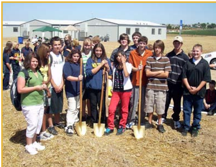
CVSA's first 9 th Grade Class!